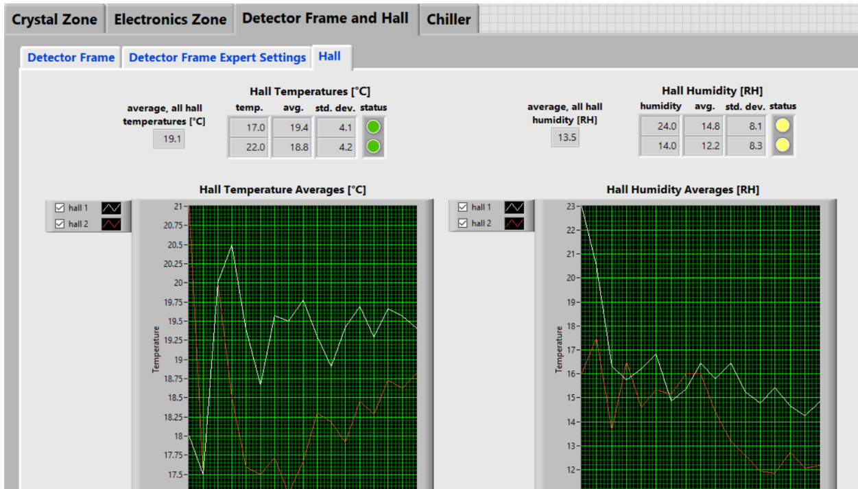
Screenshot of the Hall tab of the LabVIEW hardware monitoring program